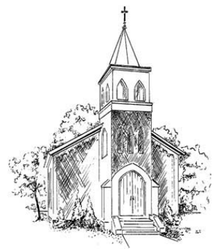
St. Stanislaus, Chatsworth Sunday 9:00 am